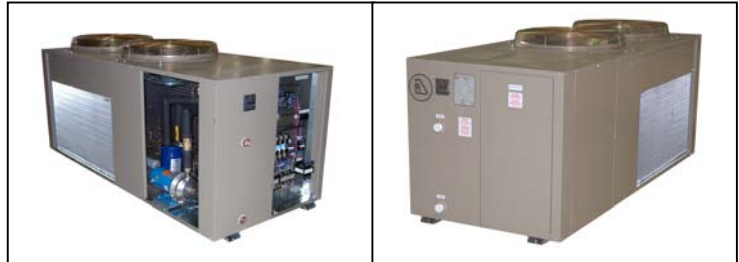
EI90 model shown