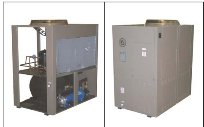
EI60 model shown